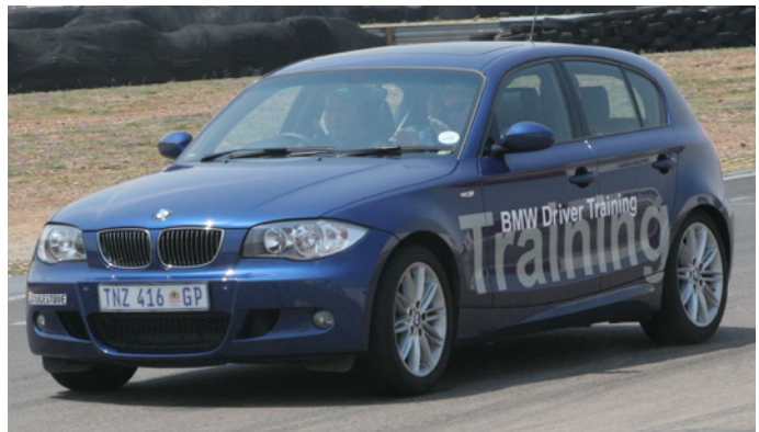
On the Zwartkops Raceway

What turned out to be an exceptional event was a South African barbecue hosted by the Menlyn car dealer. It provided an opportunity to meet BMW Clubs Africa members as well as the local club committees, namely BMW Car Club Gauteng, BMW MCC Pretoria and BMW MCC Central. The Council Meeting attendees’ feedback was that it was great to meet some local owners! Zwartkops Raceway outside Pretoria, a very short and tight track more suitable for Boxer Cup racing, was next on the agenda. Hosted by the BMW Driving Academy using BMW 130i, 330i as well as BMW M3 cars and Minis, the participants were taken through a number of exercises. A special treat was provided by the local clubs showing off their vehicles in a concourse.