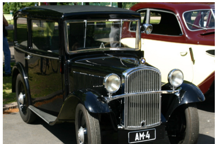
The oldest model AM-4

Almost three hundred stickers with a special 15 th anniversary logo were distributed, one for every BMW. So at least that was the amount of cars that were present. More than 600 club members visited the area. All records of their own sort. After the outdoor gathering, the event continued at the Rantapuisto Hotel where the general meeting was held. The club board presented it's current outlines and plans for club activities and additional topics pointed out by club members were discussed. Overall the meeting was very unanimous, in conclusion it can be stated that the current way of working and the board plans are well received. The evening continued with a "standard" program, dinner and sauna. During the next day some most active club members continued to discuss forthcoming club activities and implementation plans. The discussion will continue later during the autumn, in a meeting for club section heads.