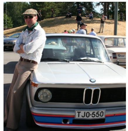
Contemporary partners at the BMW Club Finland's 15 th annual meeting (p. 03)