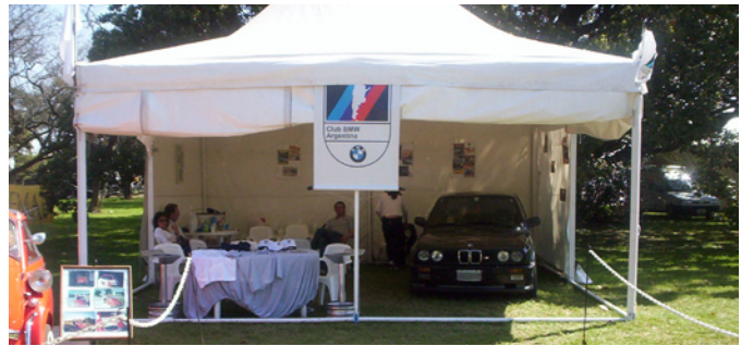
The club stand – contact point for club members and visitors