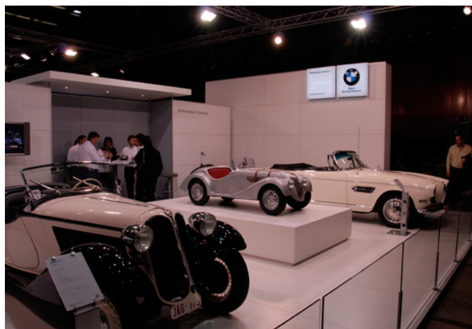
BMW Mobile Tradition presented historical BMW cars

The stand was built in a U shape, offering two different approaches and two different themes. The BMW Mobile Tradition side showed historical BMW cars. The other side was all about the BMW 02, which was no coincidence since it was the 40 th anniversary of this model. Although the model was very popular and still many of them are to be found on the roads, we found some special models which were especially appreciated by connoisseurs, such as the BMW 2002 Diana (of which only 12 were built), a BMW 1600 Karmann (unique model) and the BMW 1600 Baur (exclusive colour “maisgelb”).