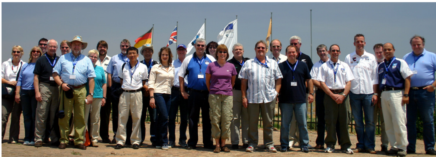
International Council Meeting attendees 2006 in South Africa