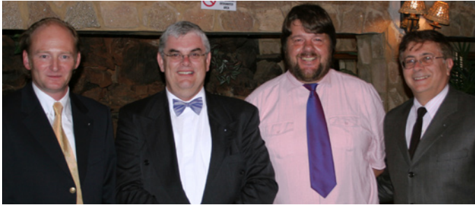
Manpower: our Board members at a glance