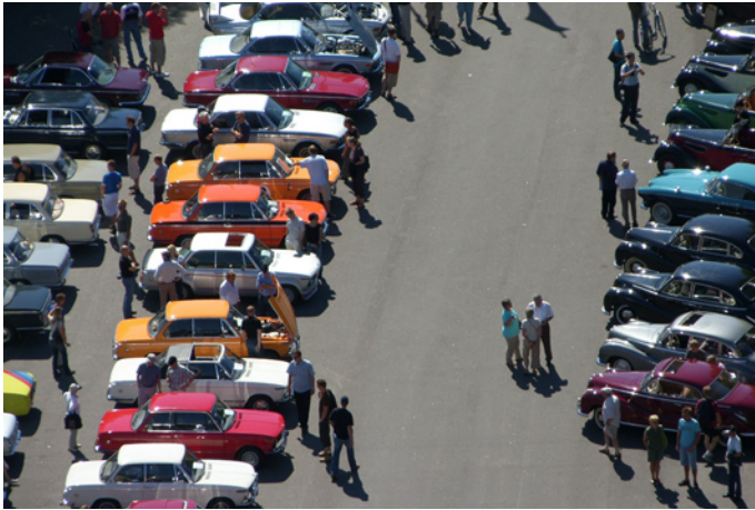
From a distance - everything looks nice