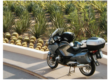
Desert Garden in La Paz (p. 08)

You will also find a current calendar of events on our website at www.bmw-clubs-international.com