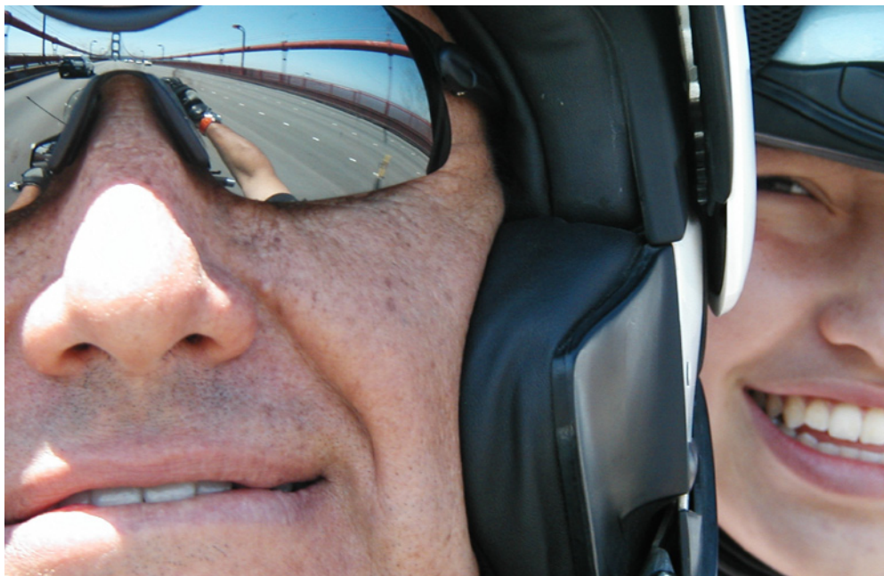
Enjoying the ride

be enough, but on a motorcycle you can go from one place to another very easily. We saw most of the interesting sites there. The bridges, museums, parks and some unique attractions such as Twin Peaks, Fisherman's Wharf, Cliff House, Sausalito and more make San Francisco a delight.