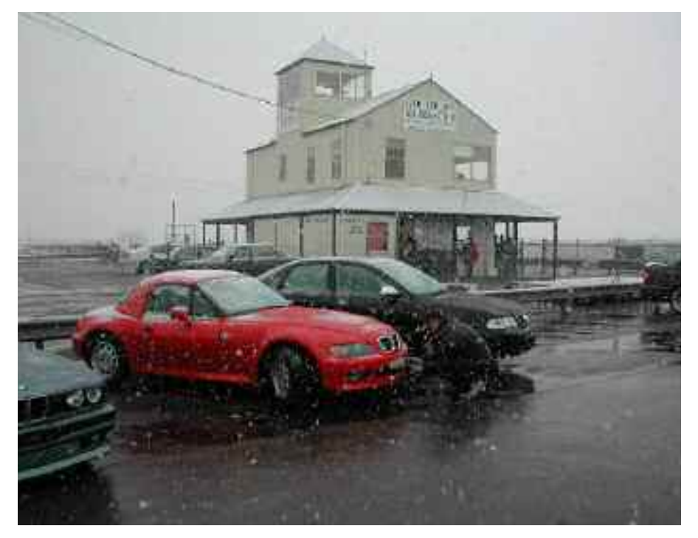
Australia with a difference.

But in July this year the weather showed what it really could be like – downright un-Australian, more like Austrian. With snow, sleet and temperatures hovering around freezing point, getting heat into tyres and brakes proved impossible. Conditions were so treacherous, the day was abandoned due to safety concerns. Few people complained as they thawed out in the comfort of a heated car on their way home to compete another day.