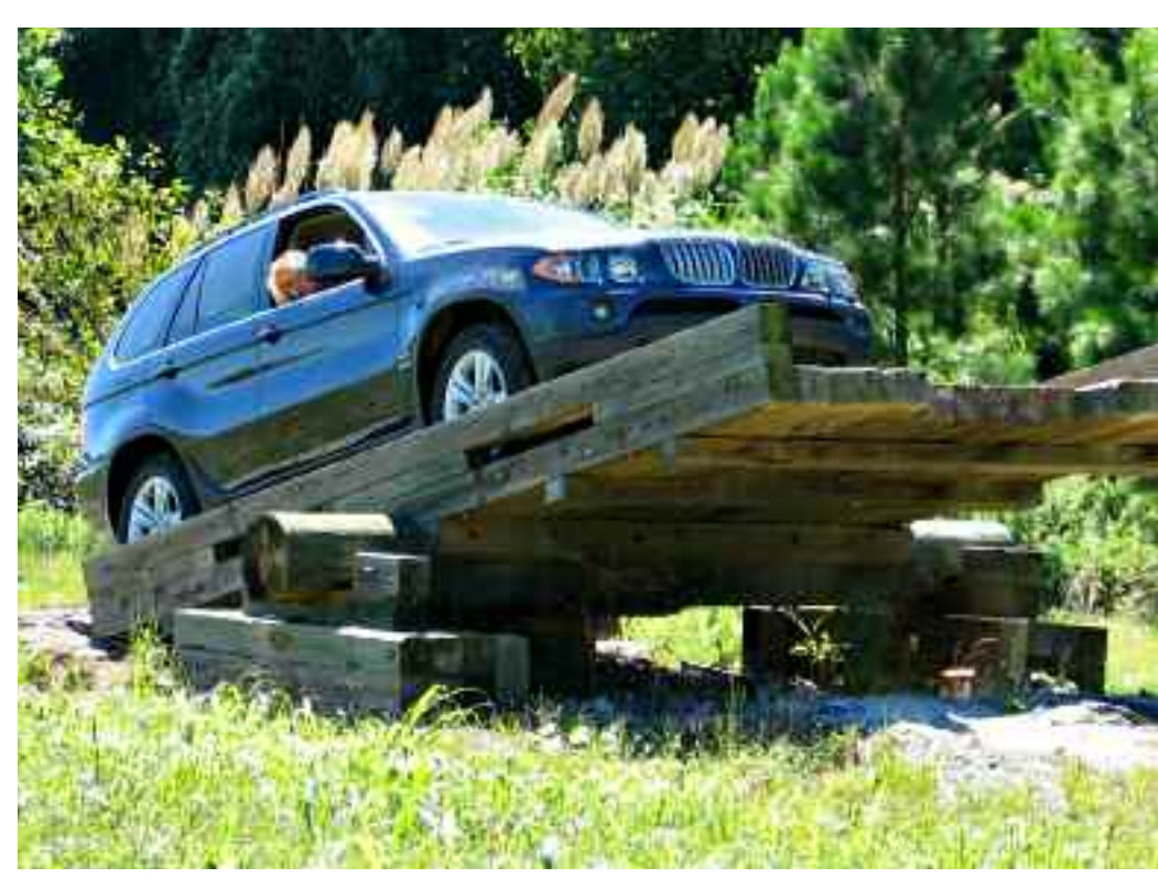
Dorothee Grau helping Phil Abrami guide an X5 up a giant teeter totter.

The front-loaded fun continued the next morning with a long interlude at the nearby BMW Performance Center, affording the Council participants extended track time in various new BMW cars. There was expert instruction in three venues, involving off-road, wet and slippery skid pad work, and dry (time trial) conditions. Wide grins were the order of the this glorious Sunday – at least until later when the group adjourned to a very "authentic" South