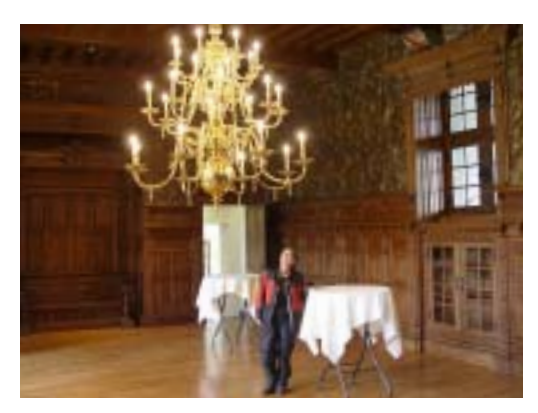
Inside a living heritage: the castle of La Roche and a BMW 502 V8 Super.

Sporting BMW fans in particular got their money's worth in La Roche. The Floreal Club has a swimming pool, bowling alleys, tennis courts and crazy golf courses for the use of its guests,