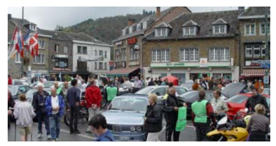
The "80 Years of the Roundel" parade was a crowd-puller in La Roche.

while the surrounding countryside is perfect for hiking, caving or gentle walks. Ambitious climbers can test their skills on the castle wall, and the small River Ourthe beckons brave canoeists.