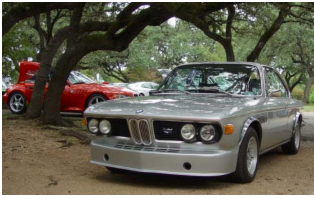
One of the main disciplines at the CCA Oktoberfest is polishing: after days spent travelling across the continent, these cherished models deserved a thorough sprucing up.

Austin, Texas. Four days on the road, nights spent in draughty motels, tepid meals wrapped in cellophane and eaten with plastic cutlery - there's little that can deter a genuine BMW CCA fan when it comes to attending the annual highlight of the American club scene, the legendary Oktoberfest. For almost three-and-a-half decades now, loyal members of the US American BMW community gather at varying locations for this traditional event to share their enthusiasm for BMWs with kindred spirits, meet up with old friends, test the performance and agility of their "hobbyhorses" on wheels, and simply have a good time.