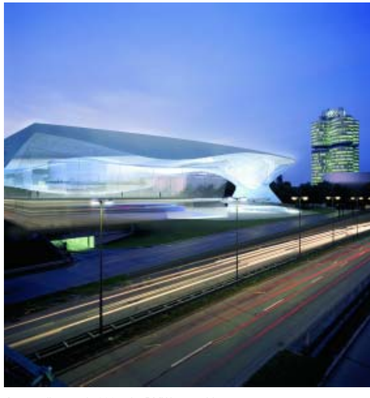
A new milestone in 2007: the BMW ensemble.

BMW's concept of presenting its brand through arresting architecture finds several emulators in Wolfsburg and Ingolstadt, soon to be followed by Stuttgart as well. None of these projects, however, can compete with BMW's unique, organically evolved urban site, whose historic core comprising the Museum, the production plant and the