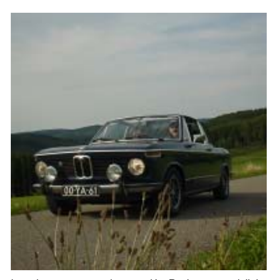
BMW diversity on tour: the twisty country roads around La Roche were a delight for motorcycle and car fans to negotiate.

Further information is available at: www.florealclub.be