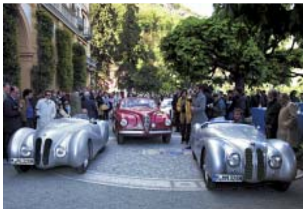
Concorso d'Eleganza Villa d'Este, 2003.

www.bmw-mobiletradition.com www.bmwmobiletradition.com/clubs