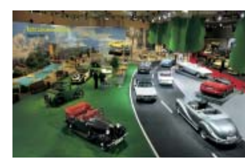
Techno Classica 2003: The BMW Mobile Tradition stand.