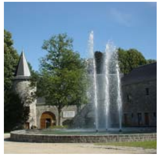
The Floreal Holiday Centre at the castle of La Roche, the venue for the gathering (above). BMW 502 V8 Super on the road in Belgium.

Stylish, sporty and romantic sums up the venue to which friends of the BMW brand came for the 41st Ardennes meeting of BMW Club Europa at La Roche, Belgium. While the assorted gems on wheels felt at home amid the castle fortifications, BMW club members went in search of a local ghost, took part in various sports and indulged in Belgian haute cuisine.