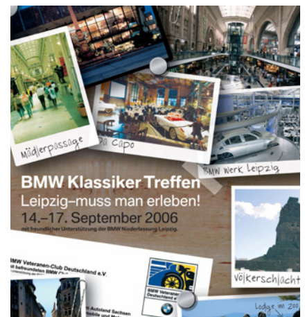
BMW Classics Regional Meeting, September 2006 in Leipzig