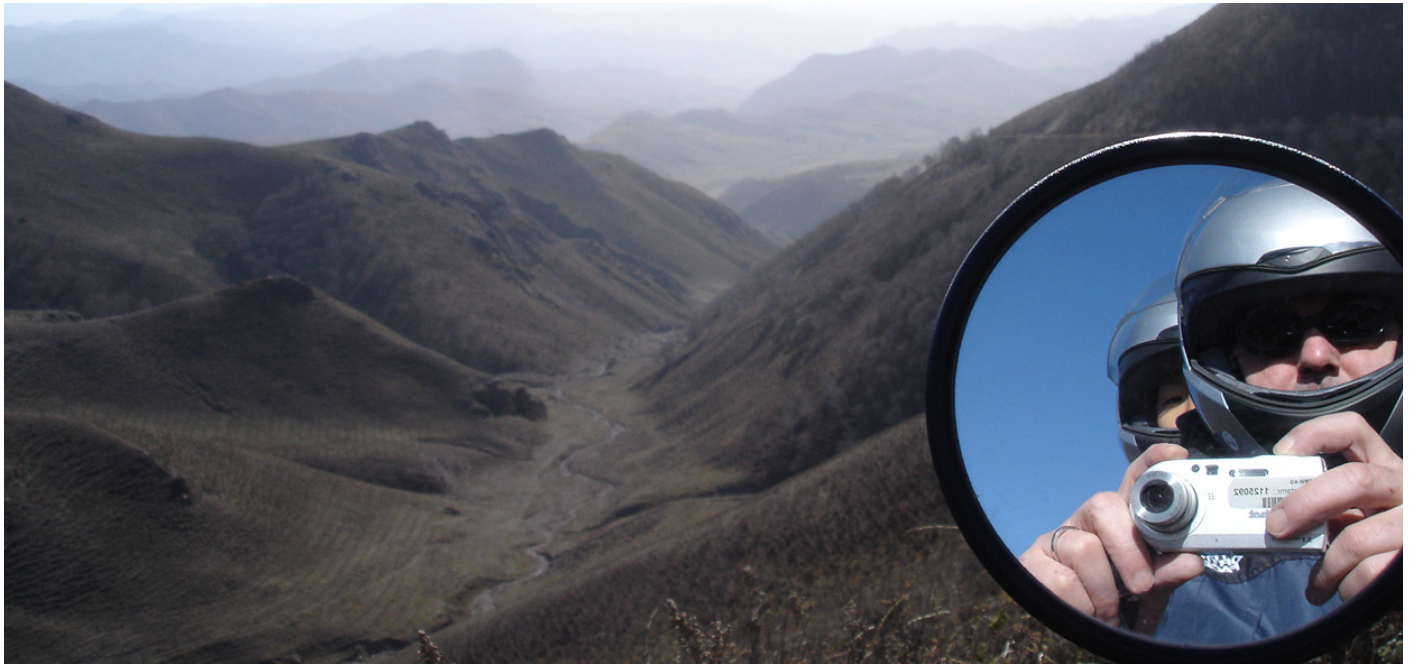
20 km before Pigtown

The village in the high plains of northern hebei province got it's name from the original “ping tou liang” and from the many pigs we spotted along the road on an off-road trip on our adventures. Untouched, not influenced by any kind of tourism and the rare occurrence of motorized vehicles make it a unique place. We believe that many locals never saw a place other than this. Leaving Beijing, it's outskirts and the great wall behind, traffic becomes light and after crossing into a narrow valley we are all alone enjoying the late autumn scenery. After lunch, a refuelling stop and stocking drinking water, we crossed a mountain pass on narrow gravel paths before we reached our destination to set up camp. End of October at over 1700m asl,