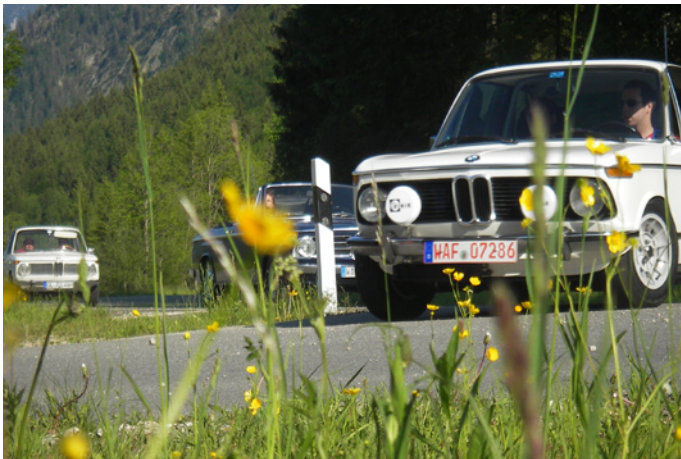
There was no lack of driving pleasure, of course, during the sunny drives through the foothills of the Alps.

BMW enthusiasts spoil themselves and enjoyed hospitality and the most marvellous weather in the Bavarian capital for four wonderful days. The team zestfully heard many positive voices after the event: