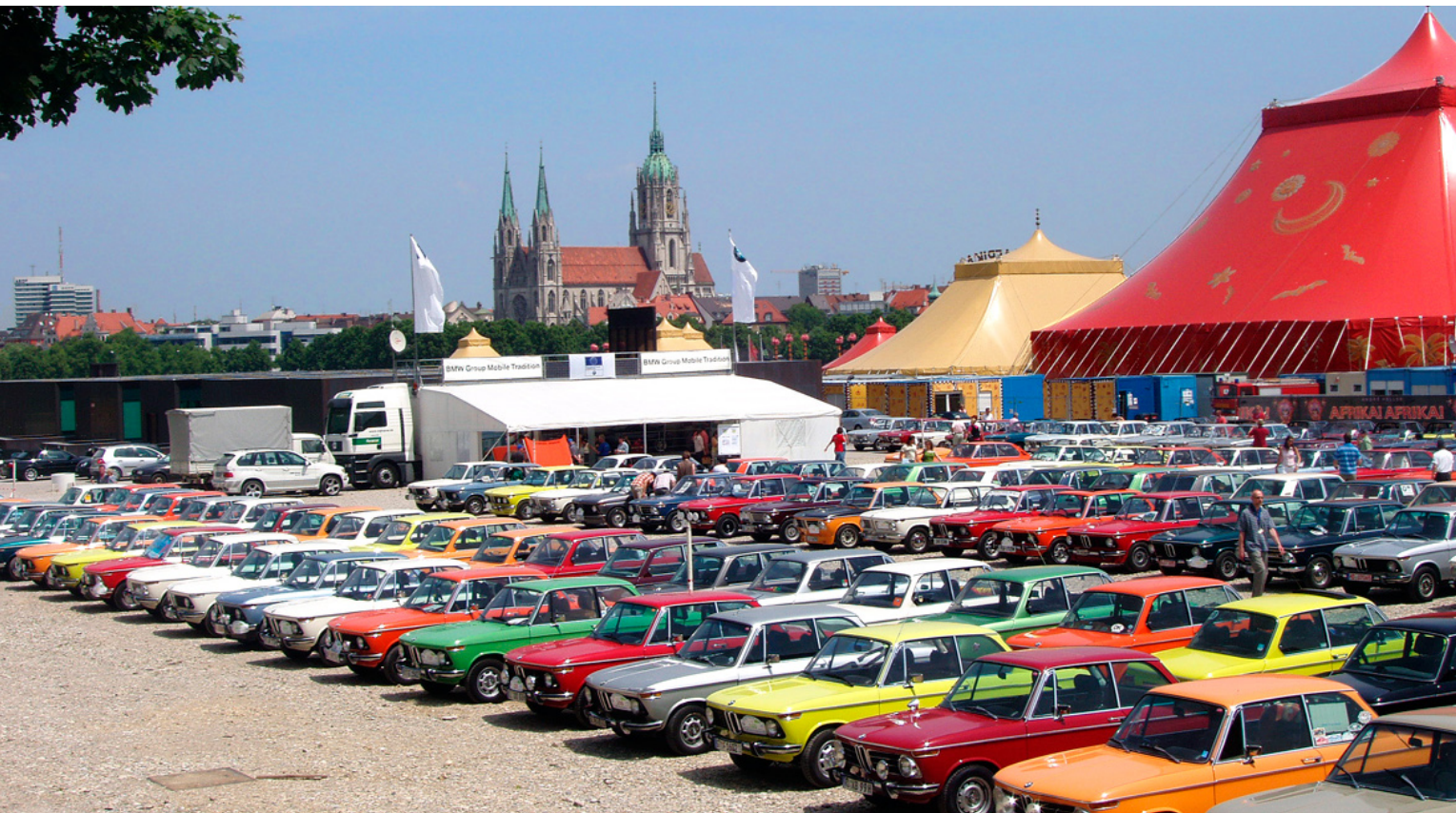
BAVARIA TOUR '06 – A beautiful day in Munich.

Newsletter of the International Council of BMW Clubs