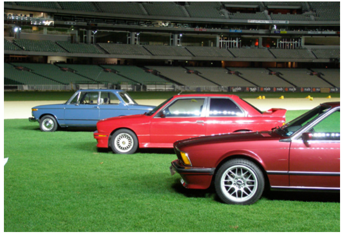
... and the 20 th Anniversary of the launch of the first BMW M3