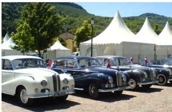
Dutch ancient on parade in Saulxures.