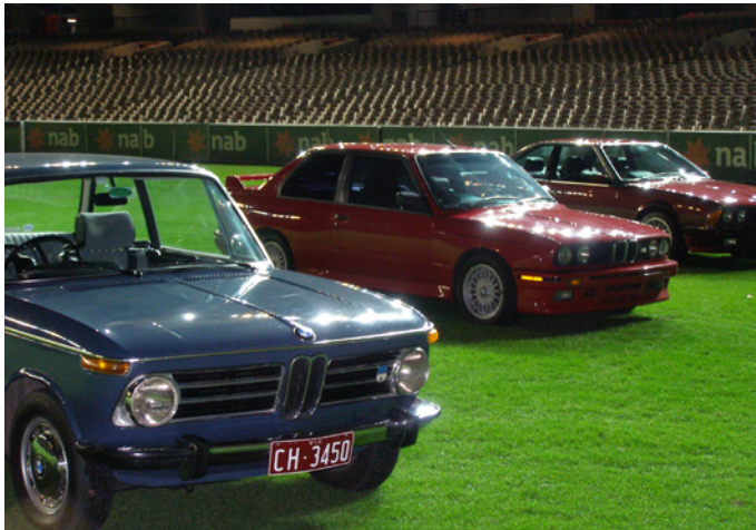
More anniversaries ... 40 th Anniversary of the BMW 02 Series, the 30 th Anniversary of the BMW 6 Series ...