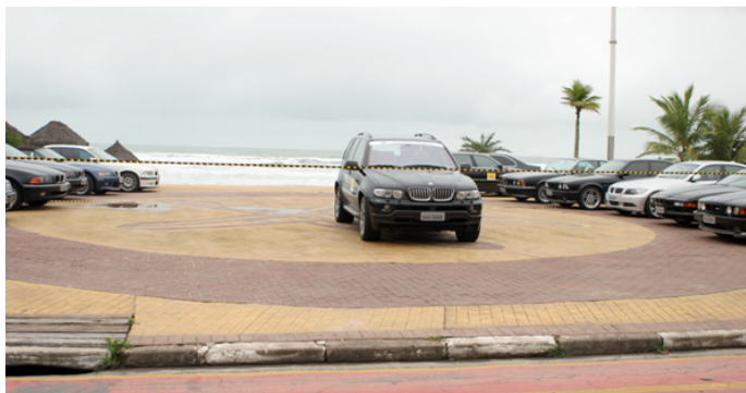
Event is Guarujá Beach

With regard to tourism, Brazil has over 8 thousand kilometres of beaches and has one of the world's most impressive ecology and nature. BMW Car Club Brasil was founded, in the City of São Paulo, on January 10, 2003, by aficionados of BMW cars.