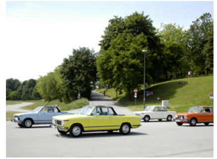
BMW 02 on the BAVARIA TOUR '06, June 2006 in Munich

You will also find a current calendar of events on our website at www.bmw-clubs-international.com