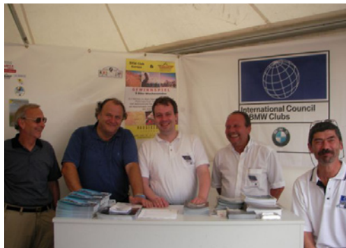
At the stand of the BMW Club Europa e. V.