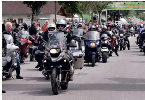
More than 800 bikers took part in a 150 km motorcycle parade from Garmisch-Partenkirchen, through Austria and back

The BMW Motorcycle Clubs from Saint-Petersburg (Russia) and the BMW Moto Club Italia were present directly beside the BCE tent. BMW Motorrad is planning to extend the club area for next year's Bikermeeting so that more countries can be present there with their BMW Clubs. If you are interested in being present with your national club or federation at the Bikermeeting