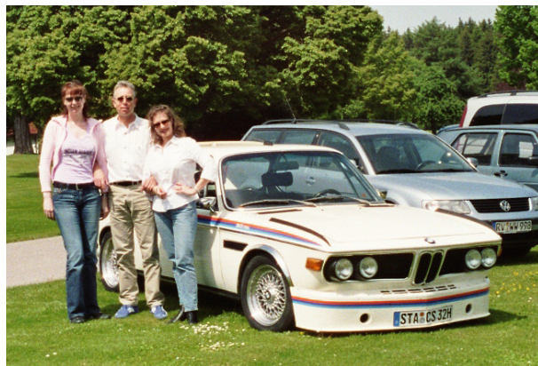
Arrival in the park from "Schloss Zeil".