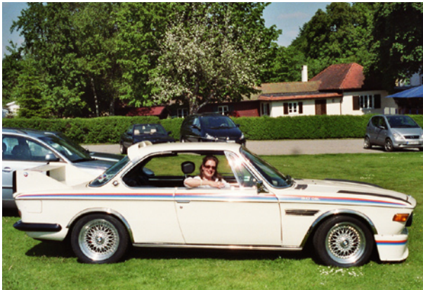
You don't want to get out anymore there.