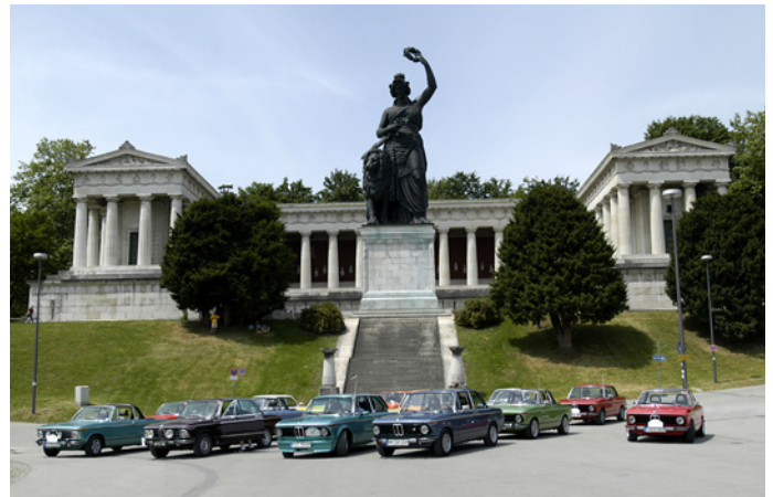
The BMW classics met at the feet of the Patrone BAVARIA on Theresienwiese in Munich.

“Many thanks from Central Switzerland. I was there for the first time and had lots of fun. I got to know lots of wonderful and very helpful people during terrific tours through magnificent countryside in beautiful weather. What more can a 02 driver wish for! Please send my thanks to the Orga Team – organising an event with more than 250 teams over four days is a fantastic achievement involving a great deal of work. I hope nevertheless that you managed to enjoy something of the event as well.”