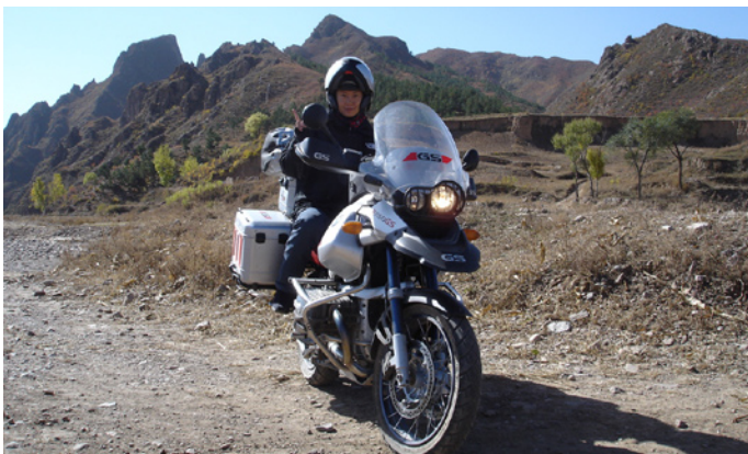
South of Pigtown

night temperatures go below freezing and accompanied by a stiff breeze there was little time for BBQ and to enjoy the views in the clear night sky. We had to return the next day, happy that our wives like it and knowing that we will come back.