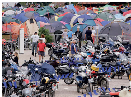
New friends were made and exciting tours hatched at the camping site