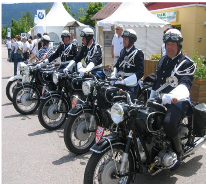
This pic of French policemen could have been made 50 years ago!