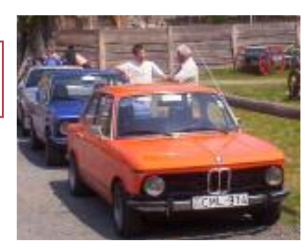
Hungarian parade: The 42nd Europa Meeting is a big hit with a unique programme.

Responsible: Holger Lapp BMW Group Mobile Tradition www.bmw-mobiletradition.com Schleißheimer Straße 416 / BMW Allee 80935 Munich, Germany Design and production: von Quadt & Company