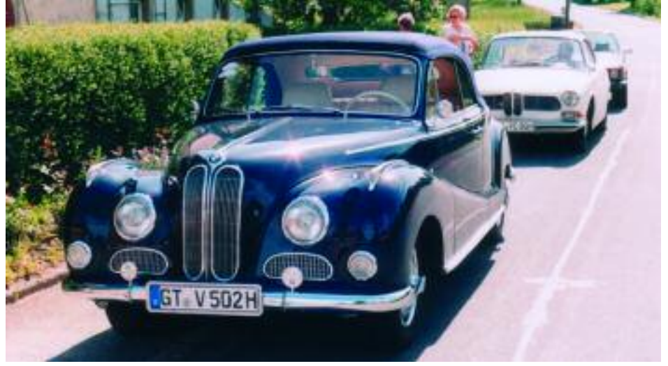
There is a large number of fans of large BMW saloons, BMW coupés and sports cars from the BMW 50 and V8 post-war era. The BMW V8 Club has an international group of members numbering 1,000 committed enthusiasts.

The BMW V8 Club presents its Internet profile with information about the big BMW saloons at www.bmw-v8-club.de.