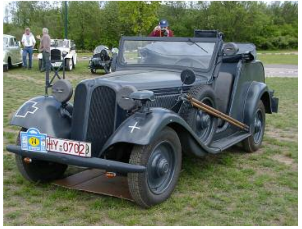
A piece of living history: The BMW telephone car was displayed in lovingly nurtured pristine form at Saarbrücken.

Although temperatures were distinctly on the fresh side, this made no impression on the 150 or so BMW cars and motorcycles and it certainly didn't put a damper on the enthusiasm of nearly 300 participants from six countries. Presentation of the vehicles in Saarbrücken and Neunkirchen and trips through the enchanting Saarland landscape provided a fascinating experience for participants and audience alike.