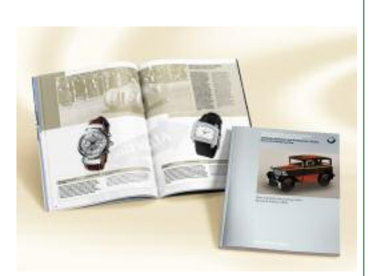
Classic BMW accessories and collectables have been available on the Internet since June of this year.

Some of the motifs have been incorporated in the design of a limited edition of mouse pads. The new edition of the catalogue also offers more new miniatures and accessories, such as three new models of the popular BMW Art Car series, designed by artists Penck, Fuchs and Nelson, cocomats for cars from the 02 Series, or the exclusive pocket umbrella with line