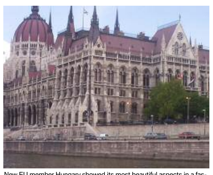
New EU member Hungary showed its most beautiful aspects in a fascinating tour programme.

Farewell drinks saw the delegates to the 42nd BMW Club Europa Meeting looking back on the highlights. They soon agreed that "This meeting was a first-class event!".