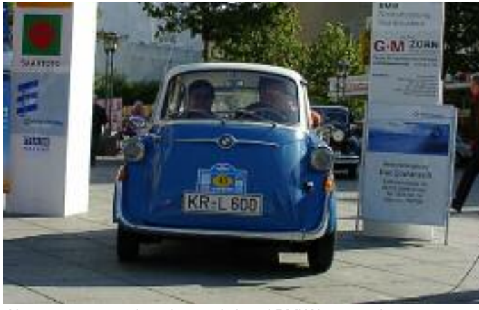
Always an eye-catcher: the much-loved BMW lsetta at the entrance to the parade.

His "sheer driving pleasure" was evident for all to see, despite the very unspringlike temperatures.