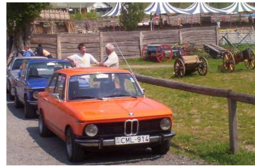
Tradition and History: BMW classics seem positively modern compared with the rustic Hungarian wooden carts.

This event offered an opportunity to meet people with a common interest from all over Europe and also to experi-