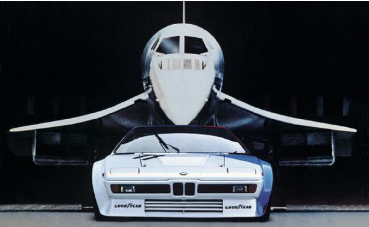
BMW M1, 1981 – year of birth of the International Council of BMW Clubs

Newsletter of the International Council of BMW Clubs