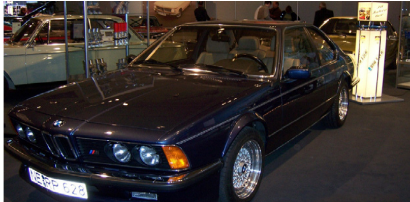
BMW 6er Club e. V. excellently presented at the 18th TECHNO CLASSICA

A 1980 BMW 635 CSi was provided from the BMW Mobile Tradition stocks. This year the stand attracted many visitors – probably not only because of the anniversary but also due to