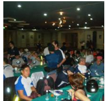
Unexpected reunion of two friends: at the casino breakfast buffet