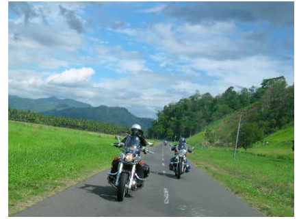
Fascinating challenge: Indonesia

Once again we can look forward to numerous events featuring BMW automobiles and motorcycles. You will find an overview of the first few events here. If you find your event is missing, please send us the relevant. You will also find a current calendar of events on our website at www.bmw-clubs-international.com