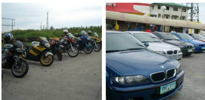
First common event of the two Philippine BMW Clubs

After breakfast and the story telling, the group then started to utilize the free tokens provided at the casino floor. The event ended with each going their separate ways. It was truly a momentous occasion as the combined run was indeed a successful and fun one. With the sun coming out to support the activity, it will definitely come out again in support of future combined activities between the two clubs.