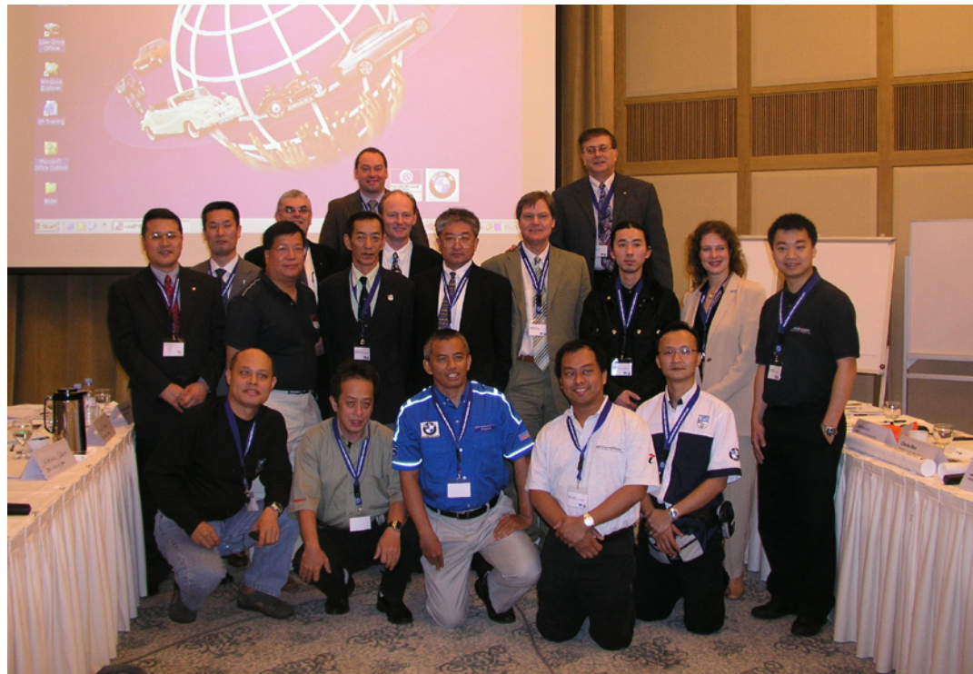
Planning annual meetings: the founders of the umbrella organisation of Asian BMW Clubs

We also spend time getting to know one another and enjoyed some wonderful social opportunities. One of these was learning about durian, the “king of all fruit”. It has a custard-like, creamy, almost velvety taste. D24 is one of the best types of durian. But why is it banned? In a word, it stinks, and not everyone loves the taste. Personally, I enjoyed it immensely. But no, I did not take any home.