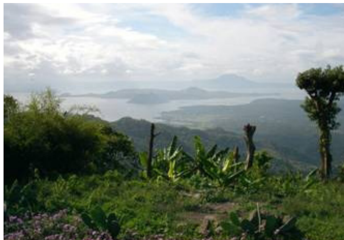
Breathtaking landscape: the trip passed the Taal Volcano

Every third Sunday of the month is a much anticipated one as it is the time when club members meet up and get to exercise their BMWs. The event calls for an early morning leisurely drive to a scenic location where group members get to have a late breakfast or early lunch; swapping stories at the same time.