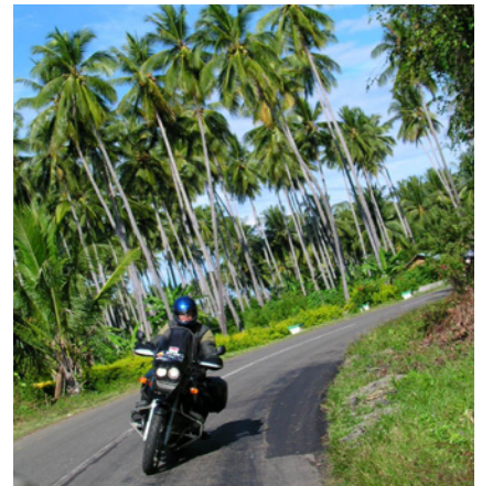
Past palm trees: a popular biker route