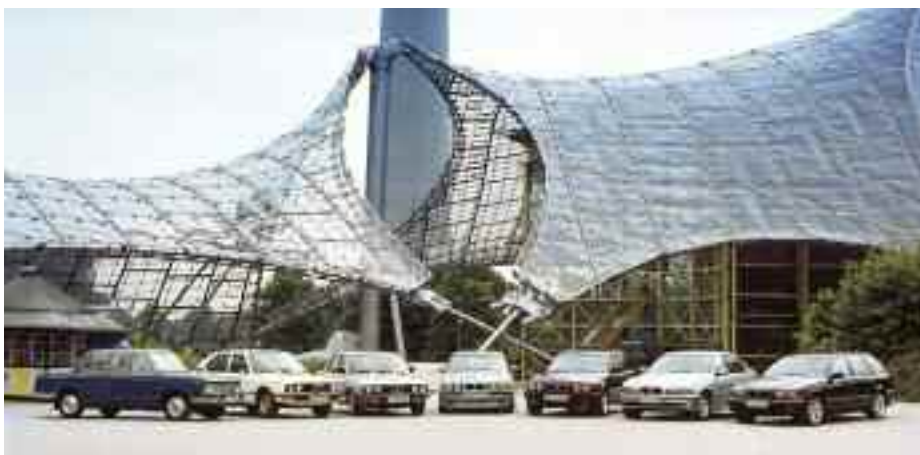
Success story in an Olympic setting: thanks to Mobile Tradition, the evolution of individual series can be seamlessly traced from the beginnings to the present.

which the numerous departments and offices dealing with the company heritage could be brought together.