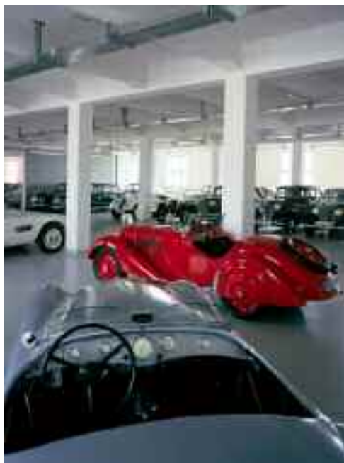
A glimpse of the vehicle collection.

It wasn't always thus. An awareness of the importance of methodically cultivating one's own historical legacy first had to grow within the company and among its executives. What sparked off such considerations was BMW's botched attempt in 1986 to introduce its corporate heritage to the public. 100 years earlier, Daimler-Benz had launched the first motor car, and this milestone of motoring history was to be celebrated. BMW felt it could not stand on the sidelines and so