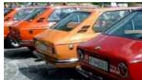
BMW 02 Club live: fans of the New Class form a strong community.

Not just supporters of the BMW 02 Club know that the road is indispensable for the “species-specific maintenance” of a BMW classic. At joint rallies, vintage and classic fans experience driving pleasure and inspiration in the company of likeminded drivers, and we want to ensure that you don’t miss out on any of the promising events of the 2004 classic season. In order to provide an overview on this page that is as complete as possible, we hope we can count on your continued, active support.