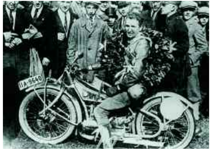
Ernst Jakob Henne after his first win on BMW at Karlsruhe in 1926.

The opening on 19th February of the exhibition in his honour featured the premiere of a documentary film dedicated to the former German Champion in the 500 and