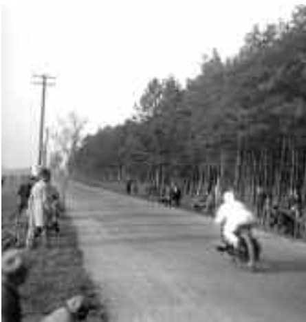
Ernst Jakob Henne chasing after a new record on the Ingolstädter Landstraße.

Ernst Jakob Henne is a man of superlatives. In the 1920s and '30s, the world-famous motorcycle racer collected an unrivalled slew of championship titles and world records for BMW. That is why the company is honouring this exceptional rider with a special exhibition to mark his centenary.