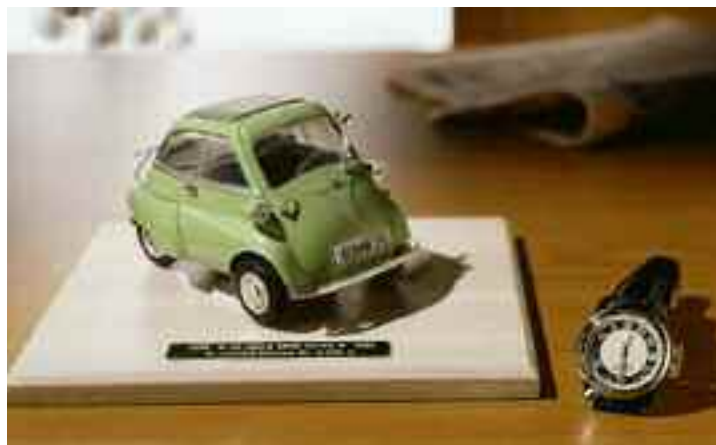
40 Years of the Isetta: the anniversary became a feast for collectors as well. This watch and commemorative scale model are now rarities.

2004 brings a restructured BMW club scene and with it a major boost to all activities relating to the company heritage. Further projects will focus on the development of MINI and Rolls-Royce heritage activities, as well as promoting BMW Mobile Tradition worldwide. A special project team is also working on the extension of the New BMW Museum, scheduled to open in 2007.