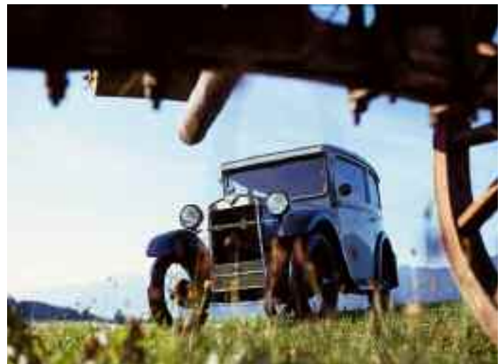
The first BMW automobile: a BMW 3/15 PS.

Various exhibitions featuring BMW classics and the heritage with which they are bound up will be staged throughout the year at a wide range of events. The Concorso d'Eleganza Villa d'Este, for example, will this year be entirely devoted to the theme of the 75th anniversary. First held in 1929, it is the world's oldest surviv-