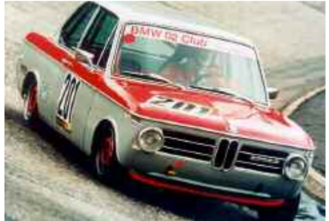
A tradition apart: the BMW 02 Club Trophy is now in its tenth year.

The BMW 02 Club has no difficulty attracting new recruits, which may well be partly down to its exceptional presence in the classic scene. Along with other type clubs, BMW 02 fans are always welcome guests at popular connoisseur events such as the Techno Classica, the Veterama or the Oldtimer Grand Prix at the Nürburgring. This keeps the New Class very much alive in the minds of fans and the public, while the tender loving care they receive from the club family maintains these priceless witnesses of their era at a consistently high polish.