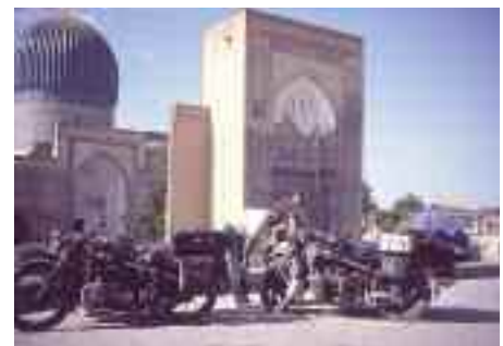
Eastern promise: the two R12 models in Bukhara on the Silk Route.

At first the two bikers were accompanied by a certain unease after being warned about ambushes and criminal activities in the no-man's land of the deserts and steppes. In fact, none of their fears proved to be founded. Instead, wherever they went they met with the warmest hospitality and well-meaning interest. Nor did their bikes ever let them down, despite the strains they had to endure. They crossed the Turkmen