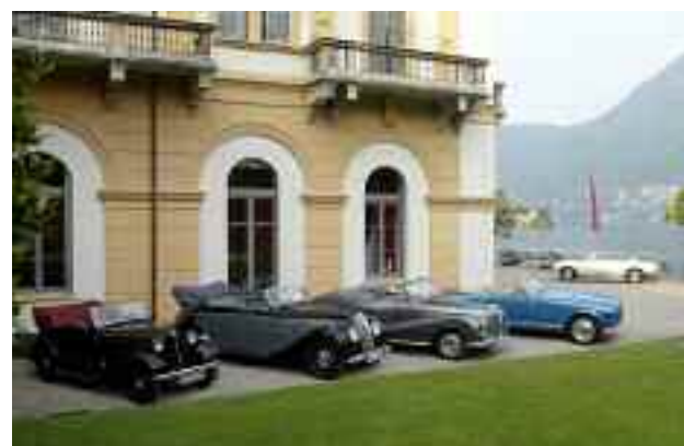
Vintage occasion: in 2004 BMW presents 75 Years of BMW Automobiles at Villa d'Este.