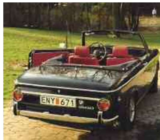
Classic fans of the BMW 02 Club set great store by “species-specific maintenance”: regular outings and TLC are de rigueur.