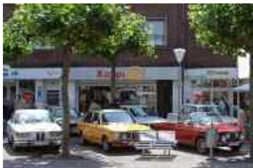
Strong draw for “youngtimers”: the BMW 02 Club.