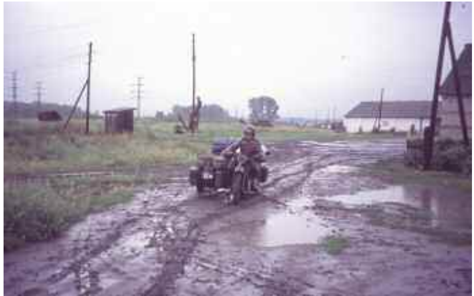
Better than any training course: in the middle of Siberia on the BMW R12.

Despite the fact that their vision of the trip was fast taking shape, preparations for the Silk Route venture would take a full two years. The bikes had to be thoroughly prepared for the task ahead and provided with all the necessary spare parts. But