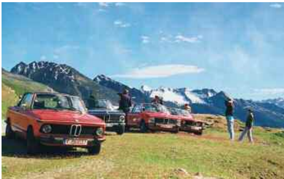
Classics of the New Class against a breathtaking Alpine backdrop: in the anniversary year of the popular 2002 models, the BMW 02 Club organized a tour of a special kind.

Today, this lively progeny of the BMW club family has just over 600