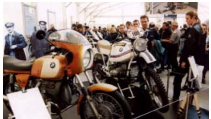
Show case 2003: the exhibition "80 Years of BMW Motorcycles".