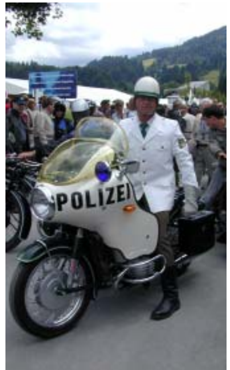
Even the police had a "classic" appearance.