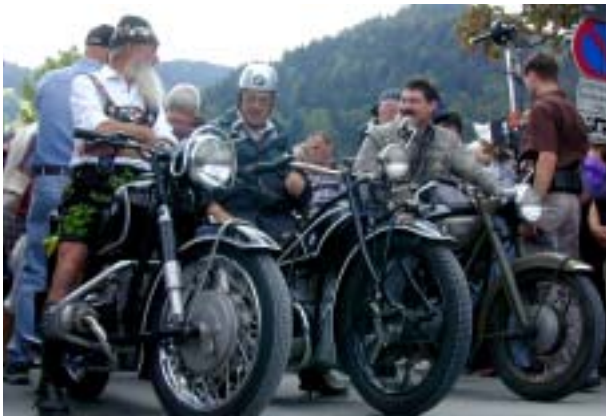
"Come together – ride now!" was the motto for 2003. About 28.000 bikers followed the call.

the bikers' gathering. All riders of historic models were invited to take part in the Classic Corso to share with likeminded enthusiasts the unique experience of the company's heritage on the move.