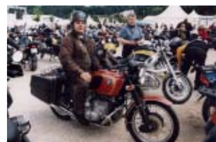
BMW Bikers' Meeting (2003).