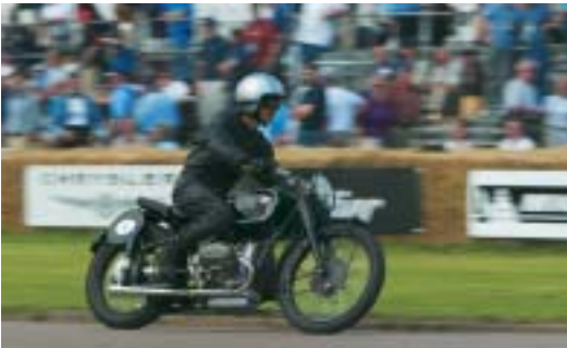
Speed is the name of the game at Goodwood.

BMW, too, was represented in the various racing categories for cars and motorcycles by a range of iconic models from the company's racing past. BMW's appearance came under the banner of two major anniversaries. "80 Years of BMW Motorcycles" was represented on the track, among others, by a BMW R 37, the supercharged model which once belonged to Georg Meier, a Walter Zeller-owned RS 500, an R 90 S TT and an RS 500 sidecar combination.