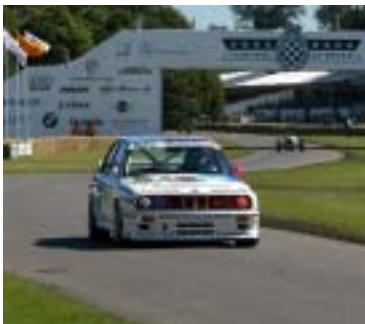
Goodwood: speed is the word.

It's a sizzling summer, not only in terms of temperature. Things have been hotting up in the BMW club scene as well. Whether we're talking about the thrilling Festival of Speed at Goodwood in England or the third record-breaking bikers' meeting in Garmisch-Partenkirchen, the Mille Miglia or any of numerous