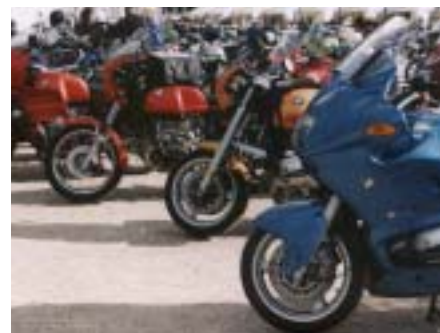
28,000 times BMW: Biker Meeting 2003.

"Ever upward" seems to be the motto of the International BMW Bikers' Meeting. The third gathering was once again held in Garmisch-Partenkirchen and boasted an even broader programme, more visitors and more fun. Heritage featured strongly in the 80th year of BMW motorcycles. Shown here, images from the 2003 event.