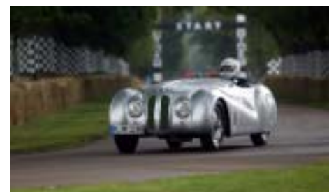
Goodwood Festival of Speed (2002).

Classics are at their most beautiful when on the move. In order to give you as many opportunities as possible to see your own or other people's classics on the road, here is an overview of the most important events lined up for the coming weeks and months.