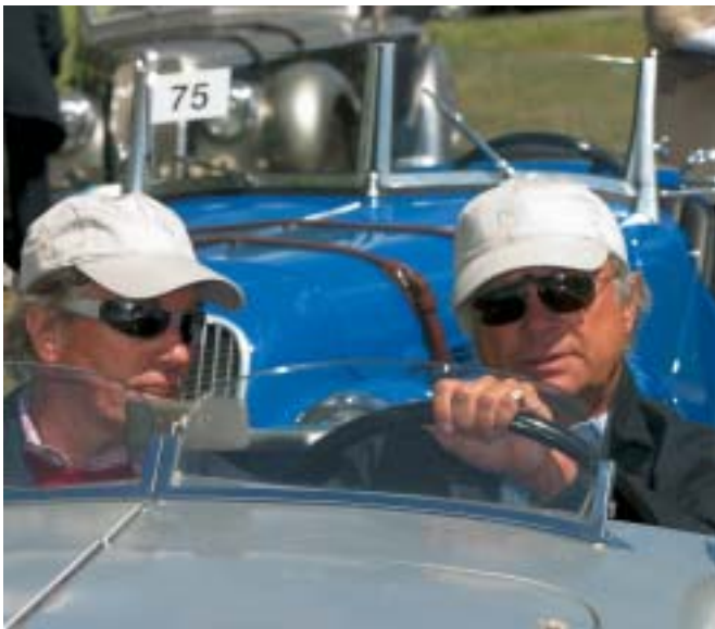
King Carl XVI Gustaf of Sweden (right) with co-driver Prince Leopold of Bavaria practising for the Mille Miglia 2003 in the BMW 328 Berlin-Rom Touring Roadster.

This year's field of BMW drivers was a particularly high-calibre one. King Carl XVI Gustaf of Sweden shared a BMW 328 Berlin-Rom Touring Roadster with Prince Leopold of Bavaria, while Italian rock star Gianna Nannini drove a BMW 327 Cabriolet, and