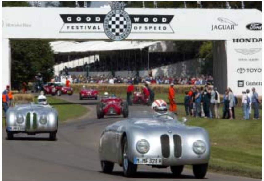
On track: the Goodwood race in 2002.

To mark "25 Years of the BMW M1", one-time Formula One driver Marc Surer competed in an M1 Procar. The triumphant 328 Mille Miglia Coupé of 1940 was also out on the circuit, along with a 3.0 CSL "Batmobile" and the winning Le Mans model of 1999, the BMW V12 LMR. The highlights were the appearances of Nelson Piquet in the Brabham BMW BT 52, with which he won the Formula One World Championship in 1983 and of Juan Pablo Montoya in the FW 24 of the BMW Williams F1 Team.