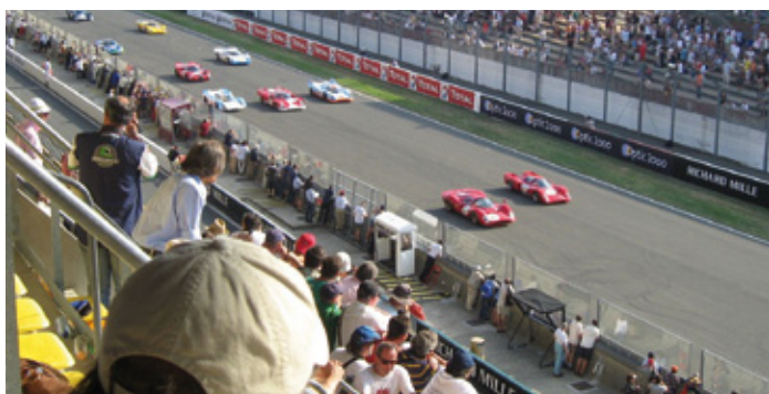
Fascinating view from above

In addition to this annual event, the Le Mans Classic has been held every two years since 2002 where historical vehicles also face up to their rivals, divided into six classes according to their year of construction. It has become the biggest vintage car race in the world – simply incredible when after the introductory lap the pace car leaves the track and the famous Porsche 917s