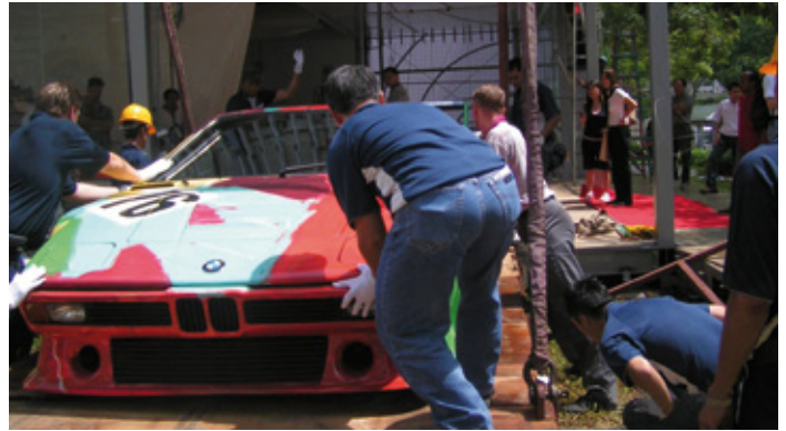
Specially trained assistants and mechanics supervise the entire transport

Specially trained assistants and mechanics supervise the entire transport, storage and installation into the event venue (e.g. a museum). And support staff are, of course, always at hand when it comes to active driving appearances (e.g. at rallies) as they are at photo shoots at Times Square, in New York. In 2009 over 280 international appearances were organised.