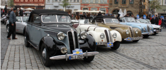
Formation of the 130 vintage cars and motorcycles in the marketplace

Text and photos: Stefan Bordt, Editor BMW Veteranen-Club Deutschland e.V.