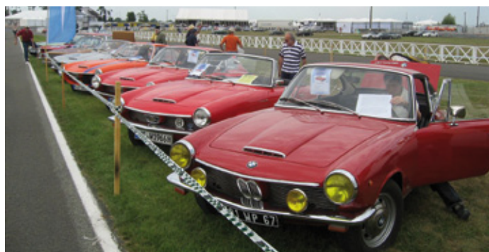
Exotic beauties in France – the vehicles of the GLAS Club members