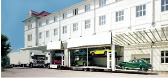
Efficient transport and punctual delivery