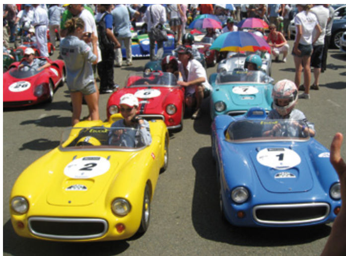
Also the little racers had fun

Passenger transport was taken care of by a club for military vehicles, and so drivers, mechanics and VIPs were driven in jeeps or personnel carriers. All drivers of these vehicles were appropriately dressed and you could often hear a chauffeured officer using a whistle to clear the way. Training started at 3 p.m. and for the first time you could see the fascinating vehicles on the race track. We took up our position near the Dunlop bend in the shade where we witnessed a number of spectacular turns.