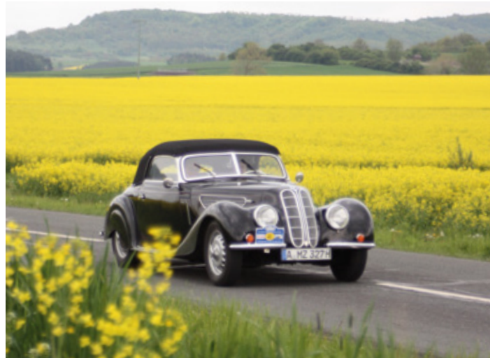
En route through the most exquisite natural landscapes of southern Thuringia.

From here we drive on to the finishing line in Coburg's market square. An Italian trio playing hits of yesteryear is especially popular. In a relaxed atmosphere, BMW friends discuss their impressions of the 160-kilometre drive and tell interested locals about their historical vehicles. The striking image of lovingly maintained BMW automobile and motorcycle veterans amidst the unique ensemble of richly decorated Renaissance and neo-Gothic architecture in the Coburg square is immersed in the warm, soft light of the late afternoon sun.